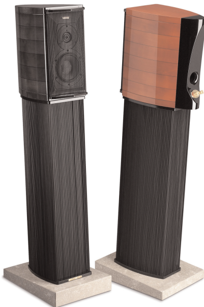
Sonus Faber - Guarneri Memento

Theta continues to innovate at the forefront of digital audio and video technology. They're virtually unique amongst the manufacturers of costly home cinema and multi-channel hardware in that their roots are purely audiophilic: this company cares about sound quality, not just the