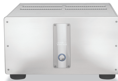
Krell Evolution 402

After many years with the FPB series, Krell tested the waters in 2005 with their current statement product, the four-chassis Evolution Preamplifier EV02 and the matching EV01 power amp. And, wow! did everyone take notice! Now Krell has followed this advance guard with an entire family of products, nine truly remarkable new components that take their lead from their flagship parents. For source components, users have a choice of the Evolution 505 CD/SACD player or, if