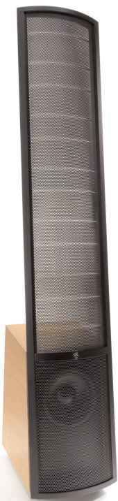
Martin Logan Vantage

certainly a must for any short list of entry-level high-end speakers. On the sub-woofer front, there's a new baby sub called the Abyss, coming above the very successful Dynamo but below the Grotto. It features a 12in woofer, front- or downward-firing, driven by a 300W amp. It uses inverse mathematical equalisation, for sound to suit the environment. We can't imagine a room where it won't work! Lastly are the Stage, a new centre channel, and the Ticket, a very compact and affordable in-wall model. The Stage is a terrific hybrid centre-channel speaker that fits into an enclosure only 34.6in wide, ideal for the new generation of wall-mounted displays. Better still, a pair of flush-mounted Tickets will complement an in-wall monitor so unobtrusively that we can see them appearing in studies, bedrooms and anywhere else a secondary system is used. Take it from us: MartinLogan has now covered the entire span of both two-channel and home theatre needs.