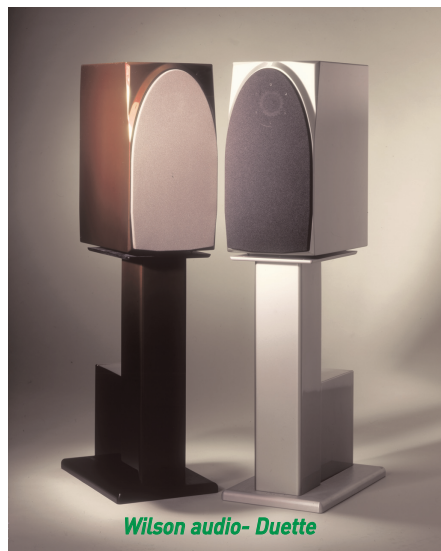
Wilson audio- Duette