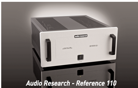
Audio Research - Reference 110

In the last year alone, we've seen darTZeel ascend to the very pinnacle